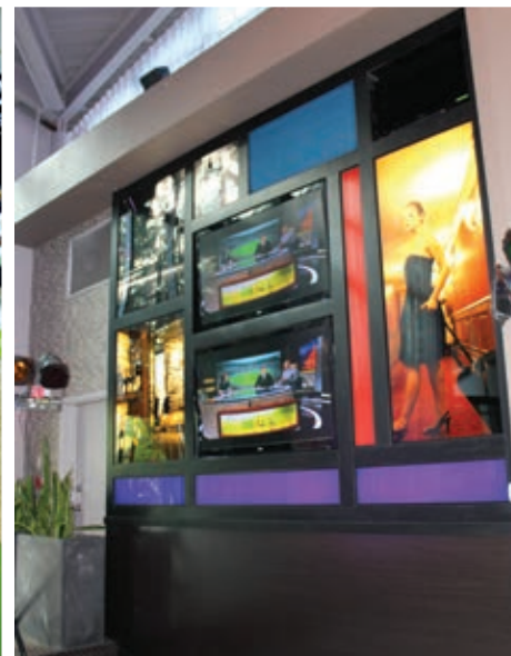
Top: Surrey Memorial Hospital - Custom Donor Wall featuring screens of scrolling donors in 5 categories.